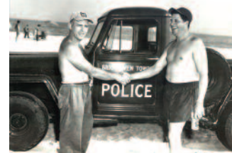
Brookhaven Town Police (Shirley beach in the background), circa 1950s

Call 399-1511, ext. 240 or simply come in with your winning answer!