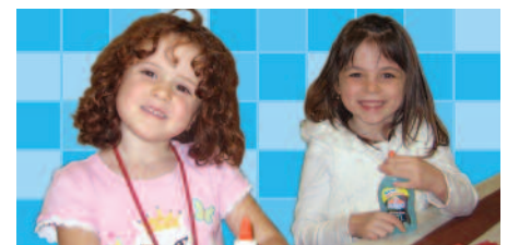
Schoolage Continued on Back Cover

Calling all Junie B. Jones fans! Children in grades 2 and 3 can join us for an hour of Junie B. Jones activities, crafts, story excerpts, and just the "fun-est" time ever. Be prepared to win a Junie B. trivia prize or tell about your favorite Junie B. selection. ■